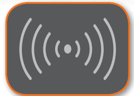
Reverse Sensing System